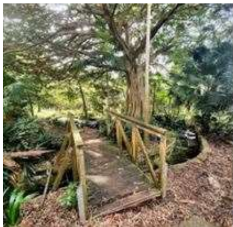
Repair of the wooden bridge

Here are a couple of things you may have noticed when walking through the Garden the last couple of months.